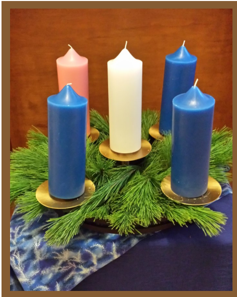
The Advent Wreath before the altar in the chapel at St. Francis House on the eve of First Advent, waiting for the coming of the light.

Advent invites us to prepare our minds and hearts for celebration of the Christmas mystery.