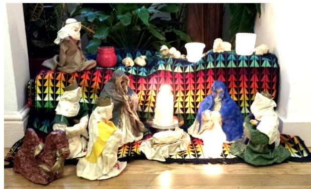
Where we’re headed with Advent: The Christmas crèche in the chapel at St. Francis House.

Advent is a busy and exciting time. It’s good to take a break from all the preparations!